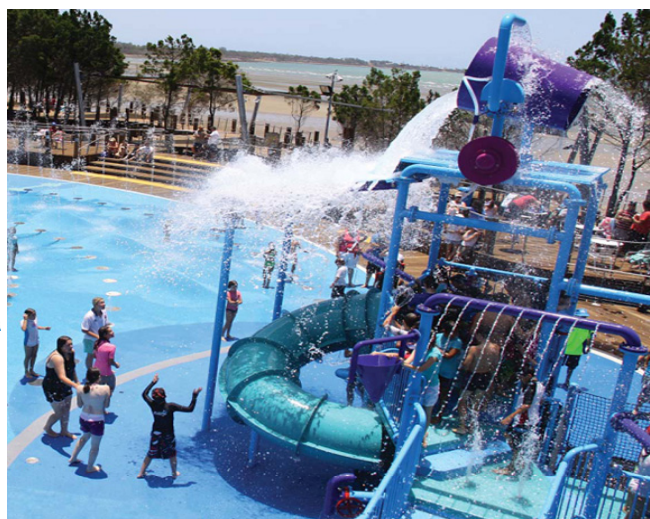
WetSide Water Education Park, a unique free public park with a strong educational message on sustainable water use.

Companies interested in participating and showcasing their products and services in the USA should contact WaterAdvocate@innovation.gov.au .