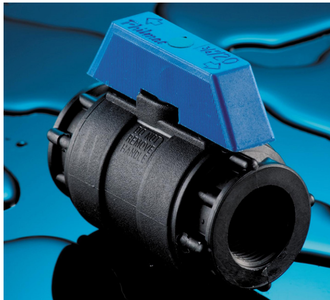
Philmac's Ball Valve, with over 5 million manufactured in Australia for Australian conditions, is used predominantly in water pipelines to help with flow control and pipeline maintenance.

waterAUSTRALIA, recently formed with the support of the National Water Commission, the Department of Innovation, Industry, Science and Research and Austrade, will create and promote a waterAUSTRALIA brand to encourage people to "think water, think Australia". For more information visit www.wateraustralia.org .